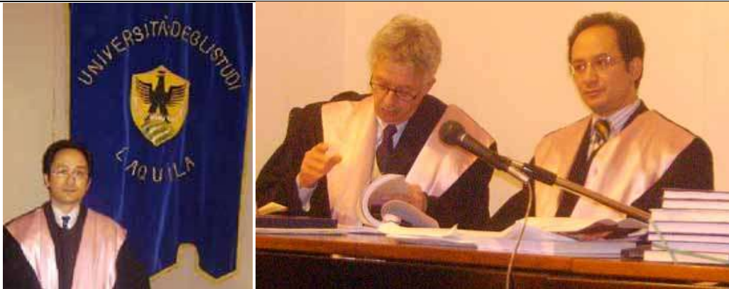
University of L'Aquila

He is a member of the scientific committee of the faculty of criminal sciences and security at the Ludes University of Lugano. - Reporter for the Criminology Thesis teacher of Clinical Criminology at the Doctorate of Criminology of the Free University Ludes of Lugano (Switzerland)