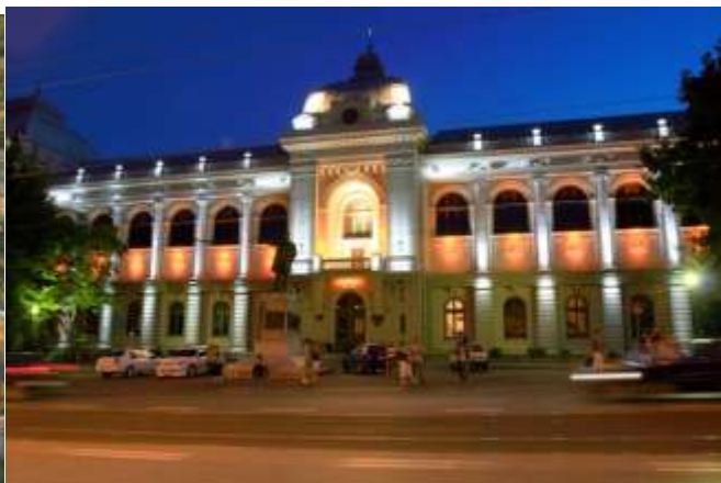
University of Bucharest (Romania)